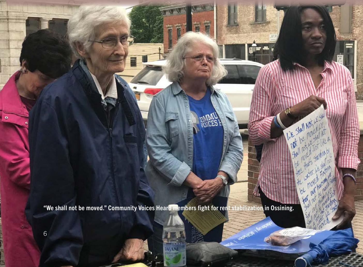
"We shall not be moved." Community Voices Heard members fight for rent stabilization in Ossining.

Low-income Westchester residents have been hurt by the county's lack of affordable housing as well as by inconsistent—or nonexistent—code enforcement that fails to keep low-cost rental housing habitable. More of these residents now play a critical role in advocating for effective affordable housing policy and housing code enforcement because of Community Voices Heard, a grassroots advocacy organization. It is assessing housing needs and pressing for more affordable homes and stricter code enforcement through a grant from the Dominican Sisters of Hope Empowerment Fund.