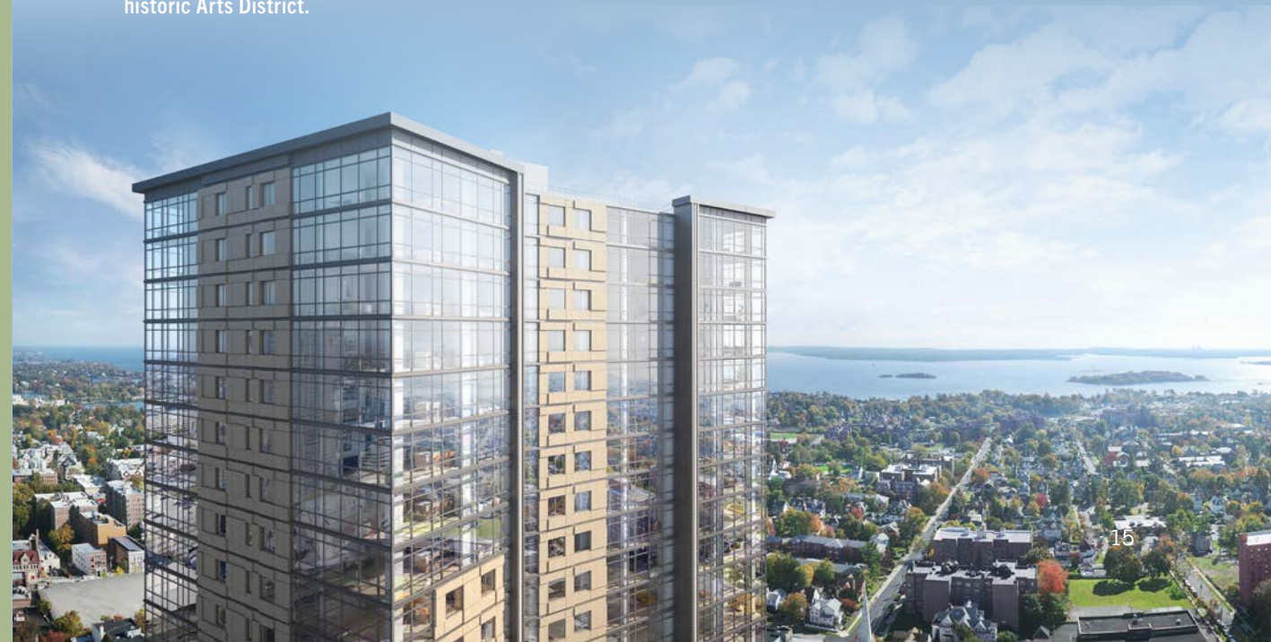
Sound View: An RXR property, 360 Huguenot, is located in New Rochelle's historic Arts District.

The company's equitable, innovative development approach extends beyond its real estate portfolio. It has launched a digital platform, RXR Volunteer ( rxrvolunteer.com ), that mobilizes skilled volunteers to help individuals, non-profits, and small businesses affected by COVID-19.