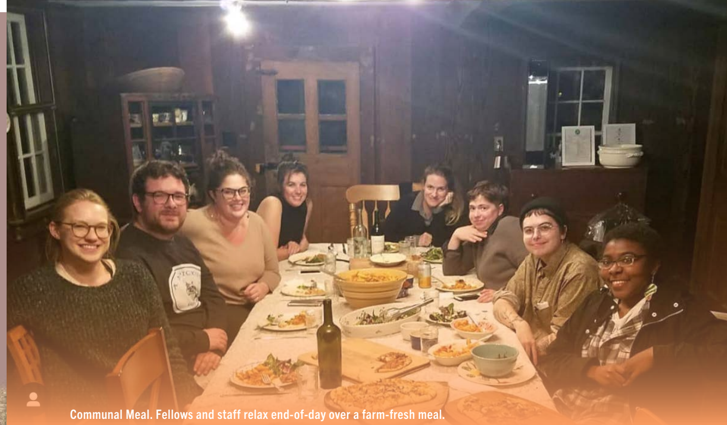
Communal Meal. Fellows and staff relax end-of-day over a farm-fresh meal.